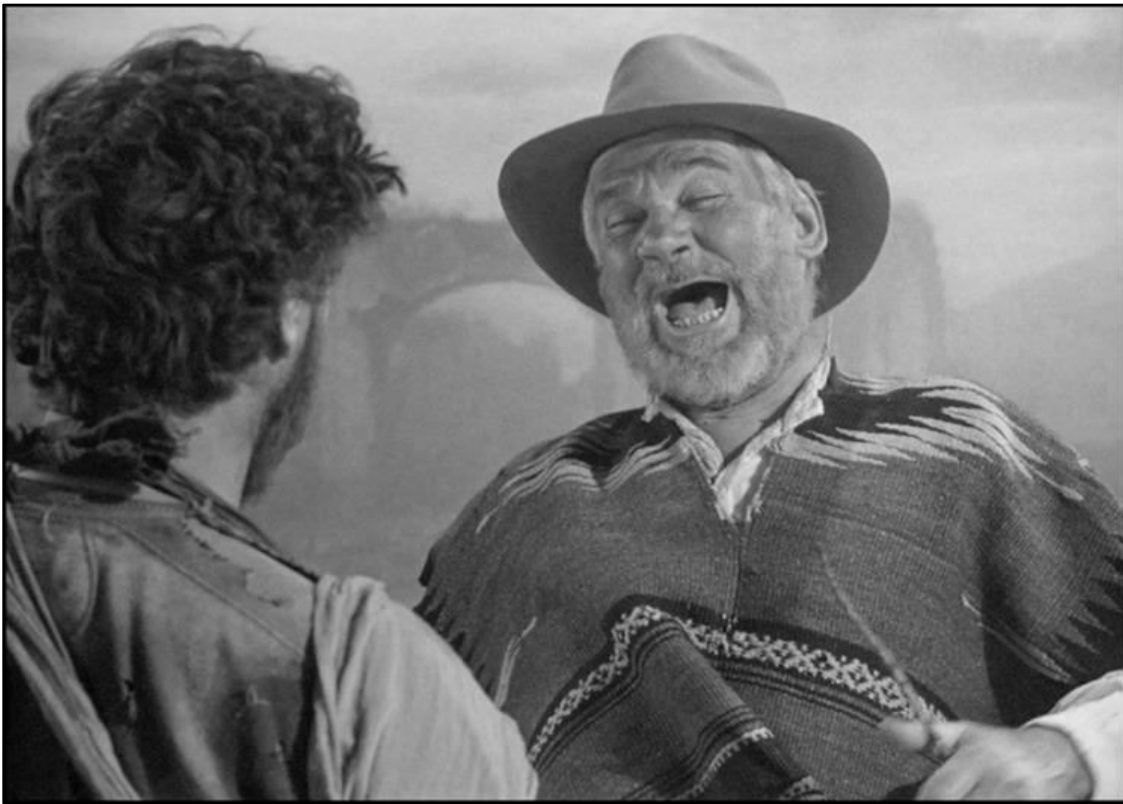
Figure 1.3 Howard laughs

laughter serves as a way of conquering the greed that comes with mining for gold. As Fojas notes in her chapter on the film, “his laughter marks the absurdity and the contradictions of capitalism, a system that devalues labor over that which it produces” (207). Through Walter Huston’s performance, this ideological comment that is alluded to in the novel is made concrete. The image of Walter Huston laughing at the conclusion of the film adapts thematic elements of Traven’s novel to the screen. 15 The laughter not only translates something that occurs in the novel but also transforms the thematic element into cinematic terms.