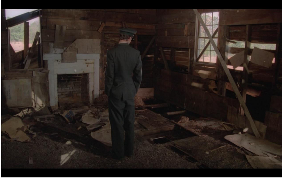
Figure 3.2 Motes walks through his childhood home

tempo of the music alludes to this dream-like state. While the theme of the opening credits signals the reality of Southern religion, the slower theme suggests the more surreal elements of O'Connor's prose.