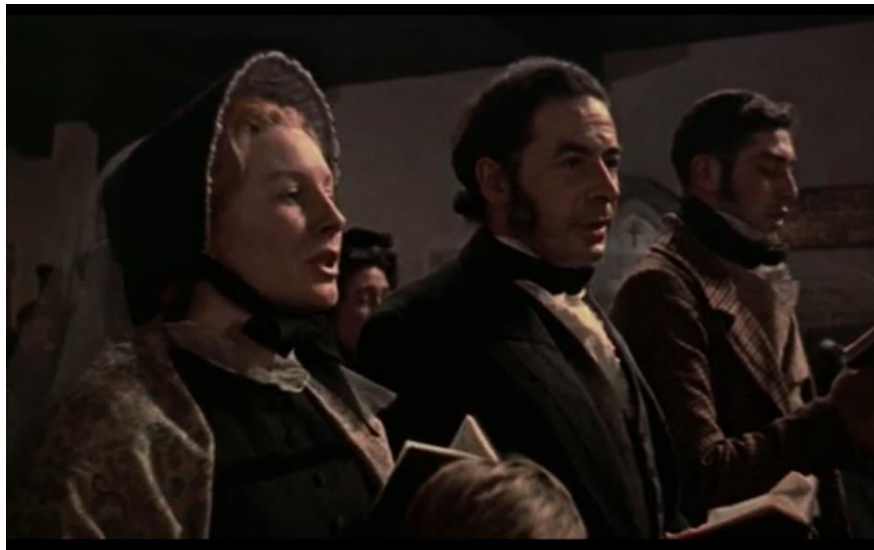
Figure 2.1 The congregation sings

begins with Jonah already inside the whale, Huston's version shifts the focus of the hymn from Jonah's redemption to Jonah's betrayal of God, eventual punishment, and final redemption. With the addition of one verse, Huston and Sinton adapt the whole of Jonah's narrative into a four-verse hymn. This final cinematic version of the hymn becomes a combination of Melville's adaptation of Psalms 18, Sinton's orchestration of Melville's hymn, and Sinton or Huston's addition of a new verse. This combination of various elements embodies the complex role sound plays in Huston's adaptation. 26