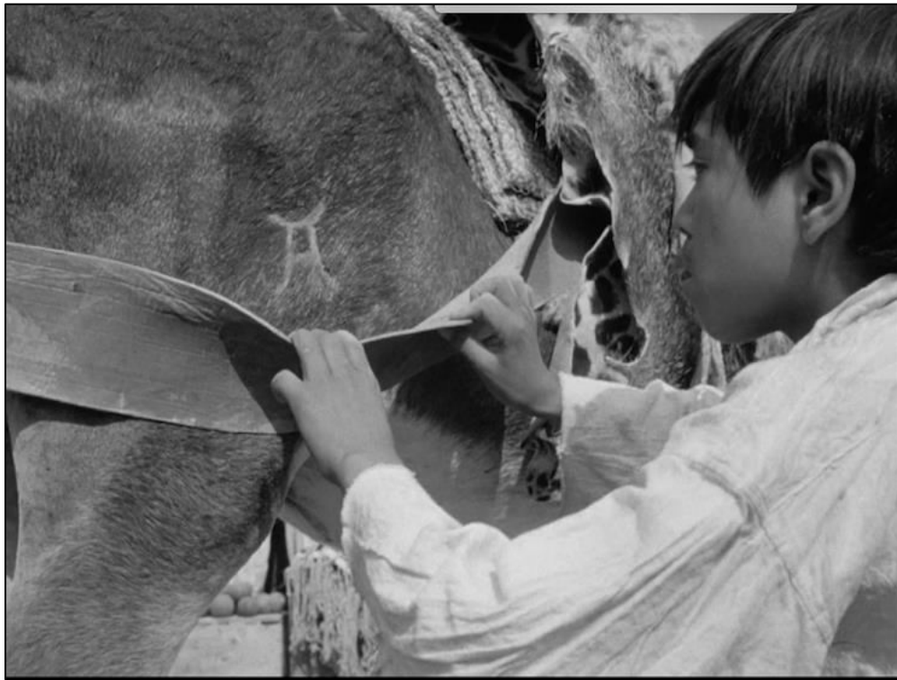
Figure 1.2 Mexican child inspects the brands of the burros

interaction does not exist. The characters' speech is delivered in English while the reader understands that these interactions are actually occurring in Spanish. In his version of the scene, Huston flips this convention on its head and instead of either giving subtitles or translating the dialogue into English; he allows the narrative to be conveyed visually. The audience sees the brands on the donkeys as the camera follows the young boy as he moves between the animals and thus understands that the boy knows that the animals are stolen. 9 As we watch the bandits go from discovery to their eventual execution, we fully understand everything that is occurring narratively on screen.