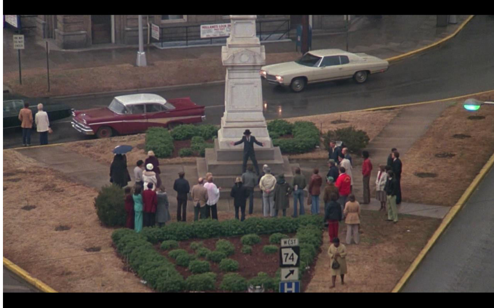
Figure 3.1 Motes preaches to the citizens of Taulkinham

own accents, lending an authenticity to Huston's adaptation that could not have been replicated with a Hollywood cast. 40