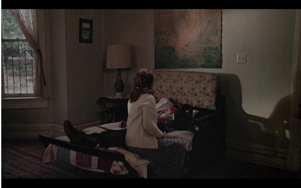
Figure 3.3 Motes is laid to rest

credits is played over the closing credits, cementing Motes's authentic transformation into a saint. 49