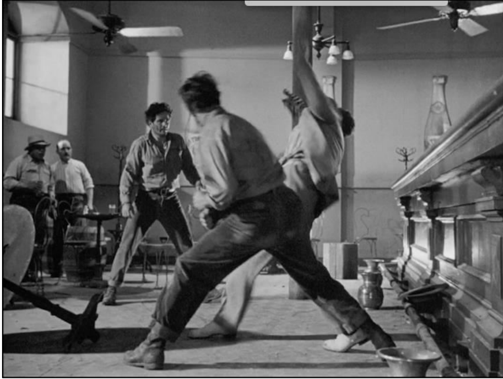
Figure 1.1 The silent cantina fight

create something that both maintains fidelity to the original text and creates a sellable product for the studio system. 8